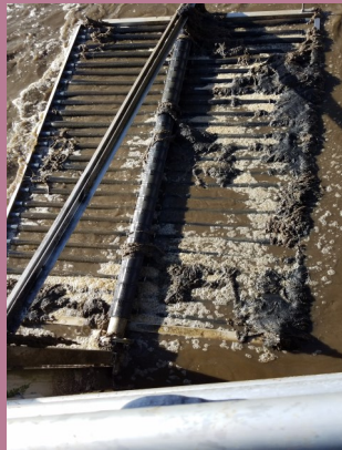
Membrane air rack at the main treatment tank. It delivers oxygen into the tank. Pictured is the air rack covered with wipes hindering it from functioning properly.

expensive homeowner repairs. As they flow intact down your pipes and out to the street, they get caught up in the wastewater pump stations and slow down or completely stop the pumps from working (see above photo). They just don't biodegrade quickly enough to avoid clogging the pipes. This creates two issues. First, during winter storm events they may clog up a pump, thus backing up the pump when there is a need for more than one pump to be running. Secondly, this is leading to crews needing to clean them out on a regular basis to prevent sewer backups. These occurrences are happening much more frequently and we need the help of the community to stop flushing these items down the toilet. Toilet paper is really the only thing that should be flushed. Anything else should be thrown in the trash. Please contact the Lincoln City Public Works Department at 541-996-2154 with questions.